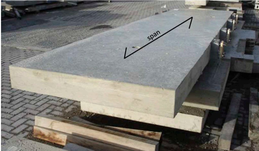
Figure 1 – RC landing slab with 4No. cast in thermal breaks.

Should cast in inserts be required these are bolted to the formwork and cast in the factory. As the slab is cast with top and bottom steel there is usually no requirement to add additional steel reinforcement.