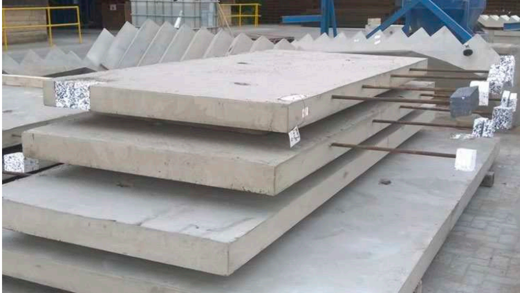
Figure 4 – Simple RC slab with cast in bars for tying back to the main floor slab.

Simple balcony slabs can be cast that are supported independently of the main floor slab and can be provided with cast in bars to tie the slab back to the main floor if required.