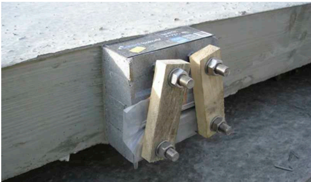
Figure 2 – Close up of cast in thermal breaks.